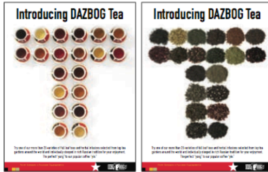
DAZBOG Promo Poster