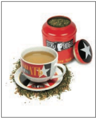
DAZBOG Packaging (China and Tin)